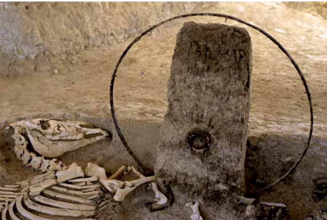
35. Part of the archeological finds at Mikri Doxipara.