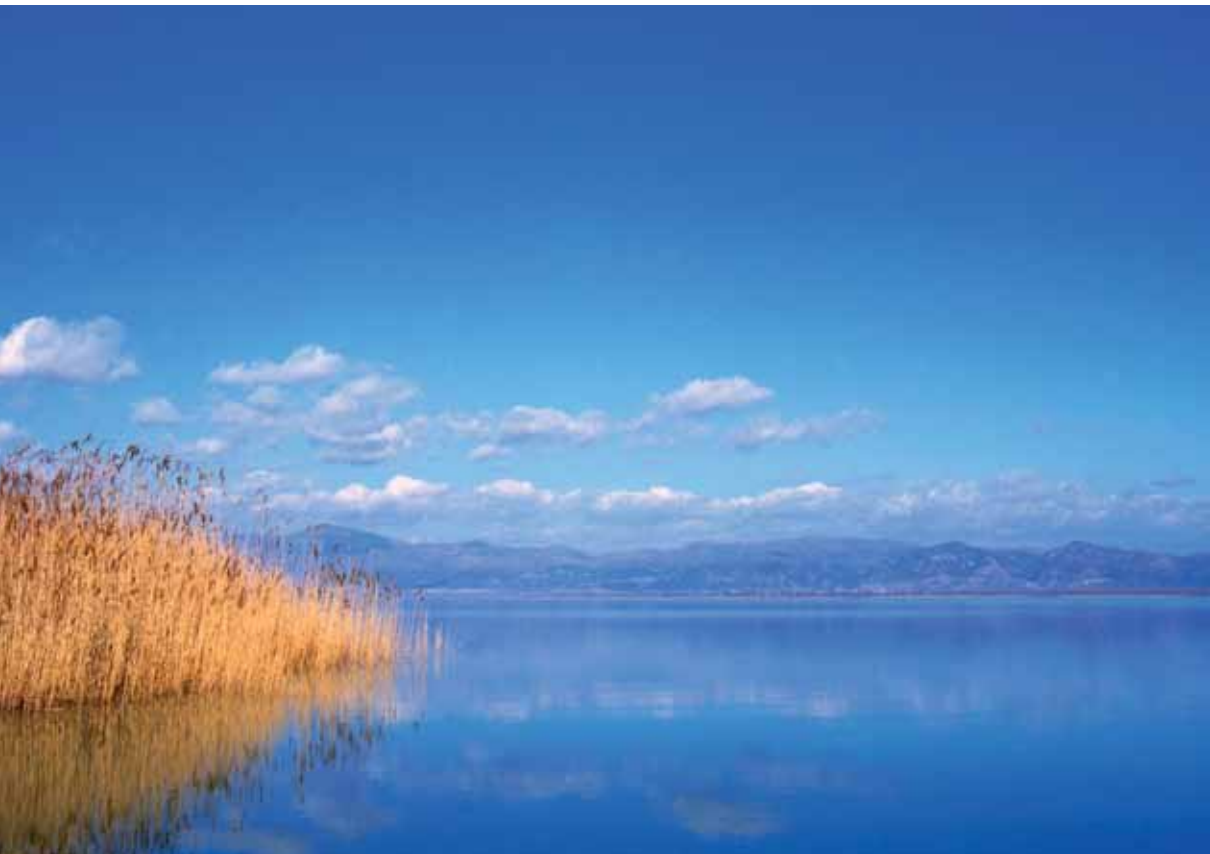
11. Vistonida Lake.

R odopi is a region of particular interest legendary for its scenery, its scope of activities and attractions and its hospitality. It has many beautiful vistas (Lakes Vistonida and Ismarida), rich flora and fauna found on the mountainous part on the east of the prefecture, archaeological sites, and traditional small villages. Its capital is Komotini, a city with a long historic course throughout which the Christian and Muslim populations have co-existed peacefully.