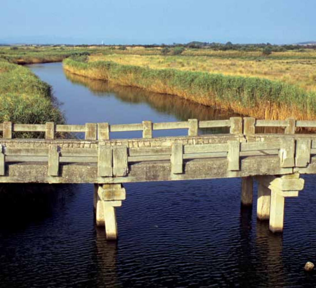
17. The natural channel through which the waters of Lake Ismarida flow to the sea.

monuments which date back to the Byzantine period (Hellenistic mansion, Roman propylon, ruins of Early-Christian churches and a monastery). Also worth visiting are the ancient theater (sitting capacity: 3,000 at the location of "Kambana"); the 4 th c. BC sanctuary (dedicated possibly to Dionysus).