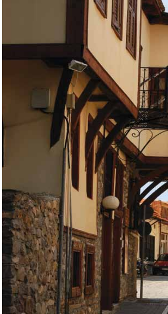
8. View of Xanthi's old town. Left: the Municipal Gallery building.