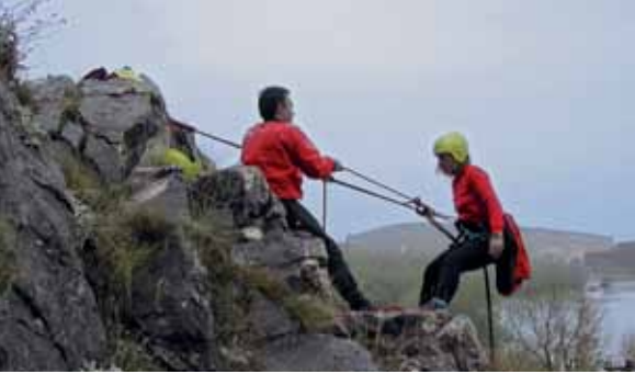
5.6.7. Xanthi District as well as the entire region of Thrace are a favourite destination among those nature lovers who delight in adventure sports.

a diocese seat between the 5 th and 8 th c. AD.