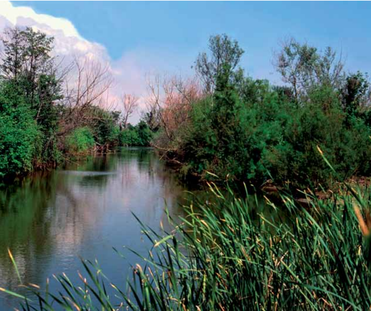
19. Lush vegetation along the Evros riverside.

L andscapes where nature has excelled itself in beauty such as the Evros River Delta and the Dadia Forest, sites of great archaeological significance, Byzantine monuments and churches, a remarkable tourism infrastructure, and a rich cultural heritage, compose a captivating picture of Greece's northeastern part. The district of Evros borders on Bulgaria to the N-NW; on the E it is divided from Turkey by Evros River; on the W it borders on the district of Rodopi; to the S the district of Evros bounds the Thracian Sea.