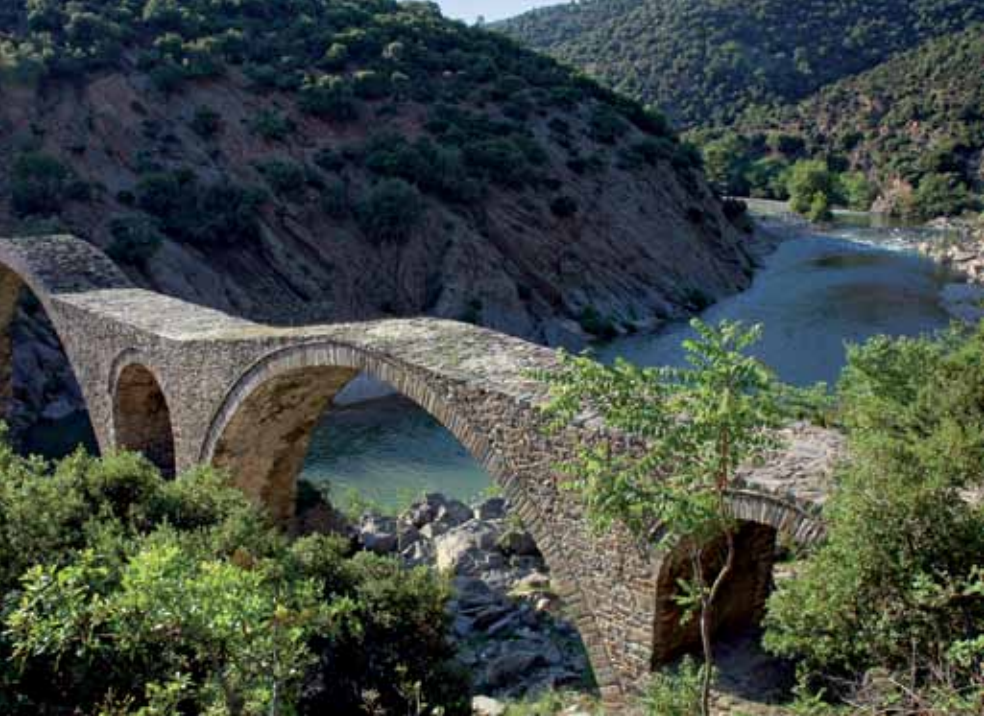
14. The stone bridge over Kompsatos River.

of artifacts created by the Roma (gypsies) basket weavers.