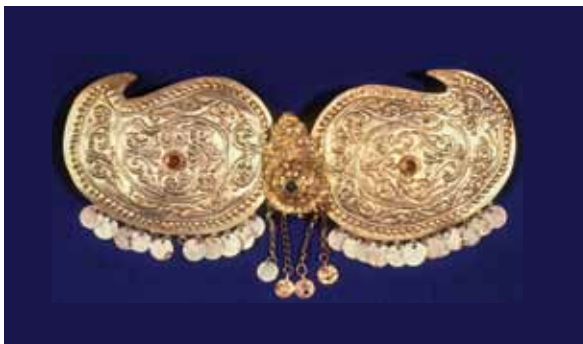
22. Traditional Thracian silver-wrought piece of jewellery.

Municipality of Alexandroupolis website: www.alexpolis.gr