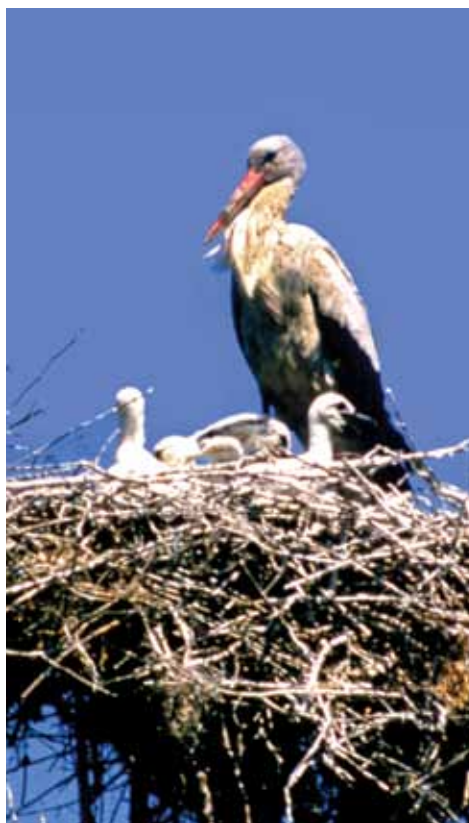
18. A stork's nest in the greater Vistonida Lake area.