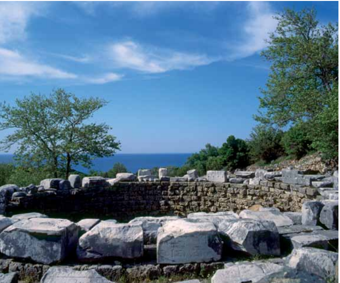
37. Samothrace: The Tholos (Vault) Building dedicated by Queen Arsinoe II, Sanctuary of the Great Gods.