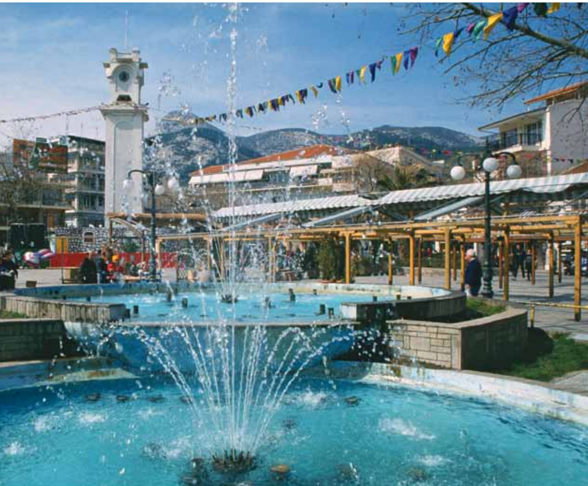
3. Xanthi's central Dimokratia Square and its distinctive clock tower.

T he mountains of Rodopi and its rioting forests, the serpentine journey of Nestos river, lake Vistonida, the exquisite old city of Xanthi and the mountain villages within the confines of the prefecture attract a great deal of visitors.