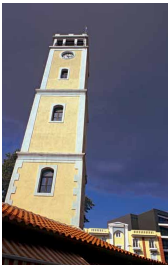
12. The clock tower, City of Komotini.