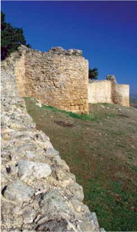
32. View from the castle's walls, Didimoticho.

the cathedral of Ayios Athanasios (1843), the church of Christ (1846) and the two caves near the cathedral where, it is believed, the king of Sweden Charles XII was held prisoner.