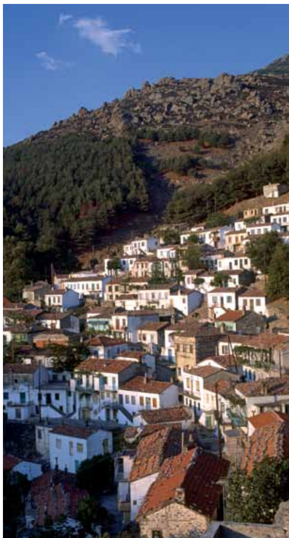
38. View of Hora, Samothrace.