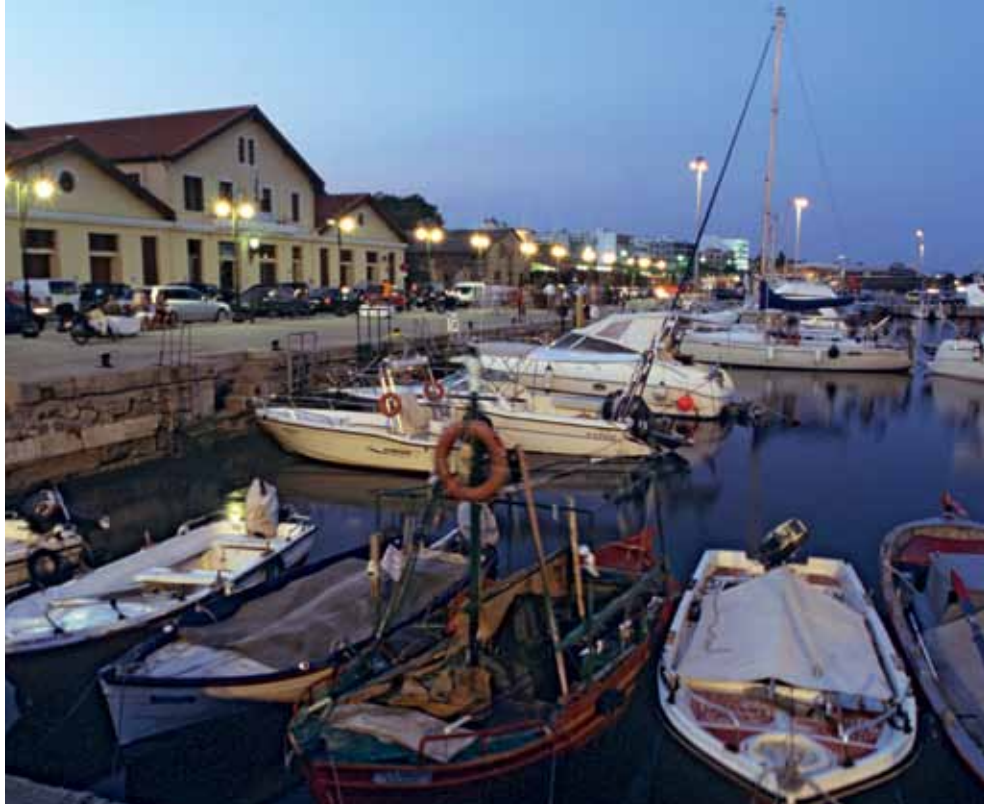
21. The small harbour of Alexandroupolis.