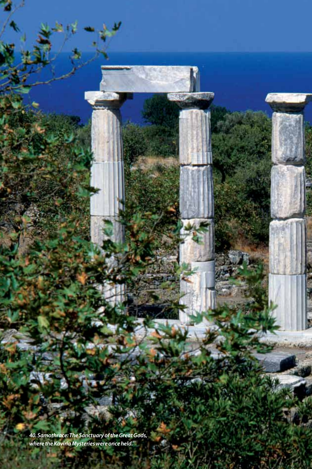
40. Samothrace: The Sanctuary of the Great Gods, where the Kaviria Mysteries were once held.