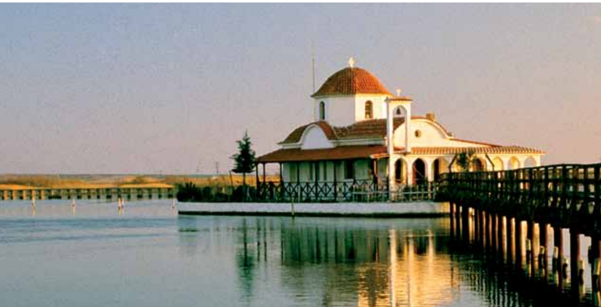
9. The Ayios Nikolaos Monastery, Porto Lagos.