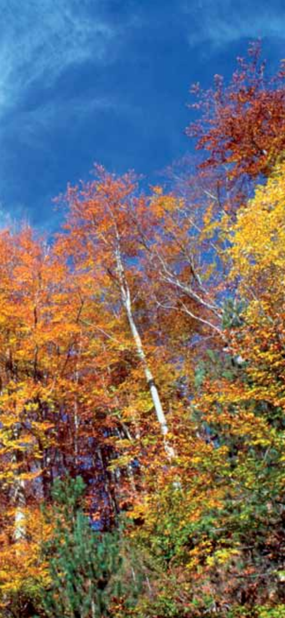
10. The Haidou beech forest covers 12 hectares of land and has been listed as a natural monument.