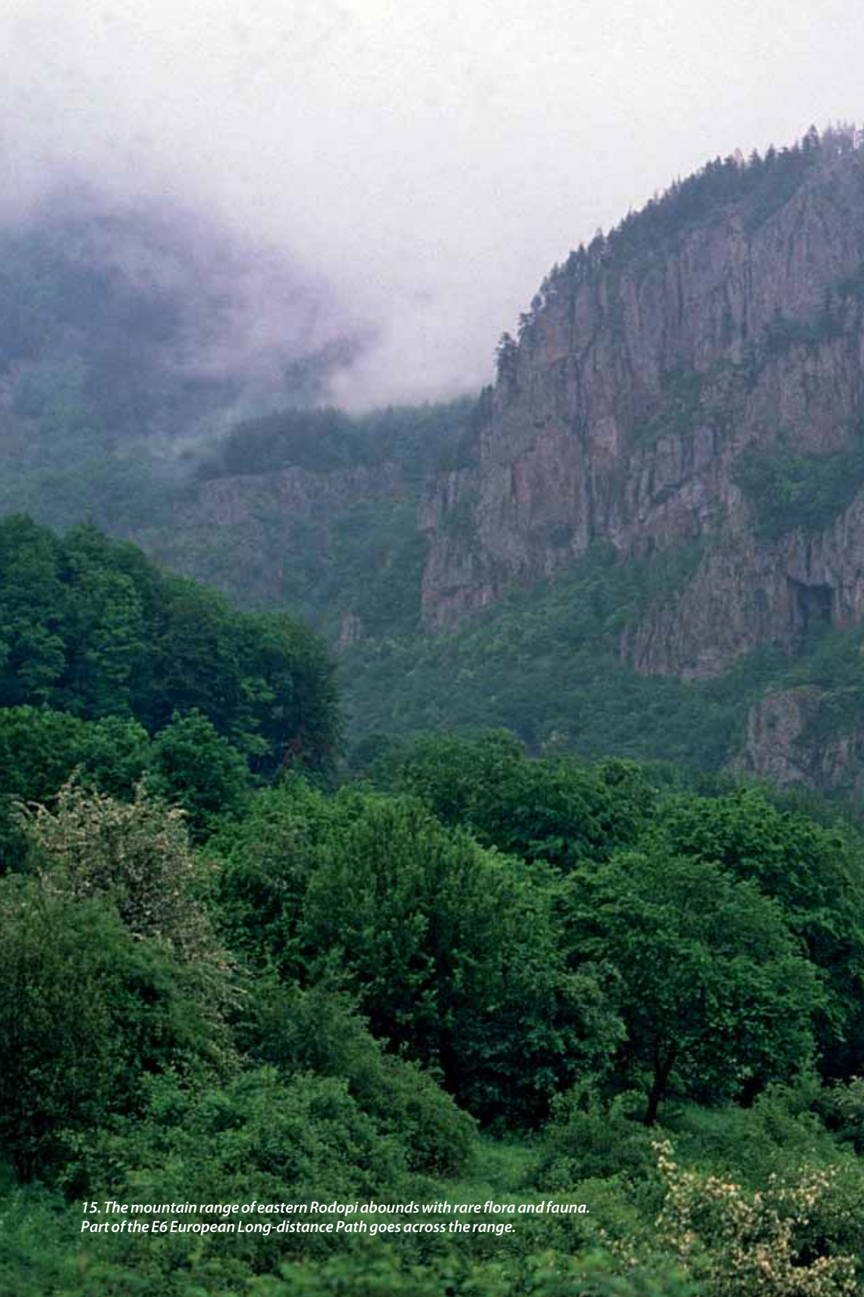
15. The mountain range of eastern Rodopi abounds with rare flora and fauna. Part of the E6 European Long-distance Path goes across the range.