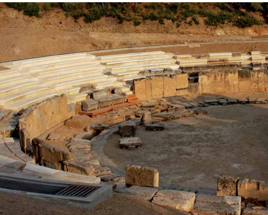
16. The ancient theatre (Hellenistic period) at the location of "Cabana", Maroneia.