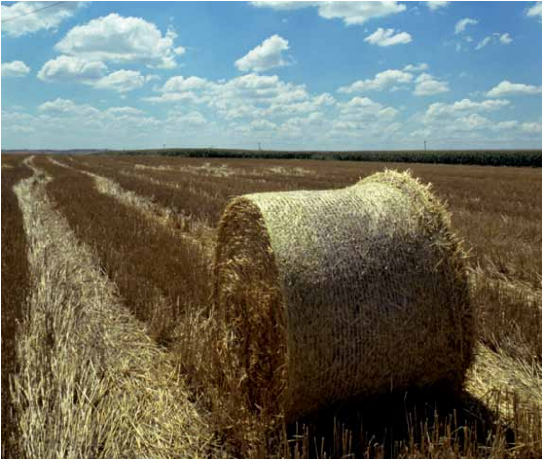
36. Characteristic "rural" scene, Evros region.