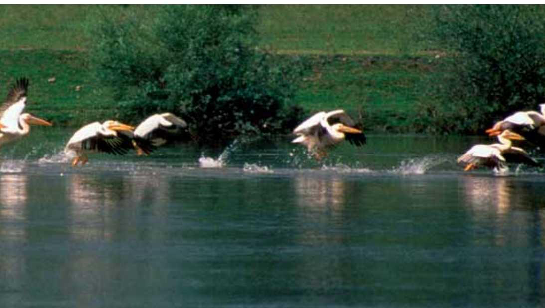
27. Flock of Great White Pelicans ( pelecanus onocrotalus ) at the Evros riverside.

river of the Balkan Peninsula. It starts its journey in the Rila mountains of Bulgaria (as does Nestos which also enters into the Aegean Sea). Evros flows through mountains, valleys, and plains and debouches into the Thracian Sea, having covered during its course a total of 530 km out of which 204 km are in Greek soil. The great value of the Evros River Delta lies in its rich avifauna: Of the 423 bird species of Greece, 314 have been recorded to have the Evros Delta as their habitat! The Delta, 11 km wide, is a biotope for nesting birds, large flocks of wintering aquatic birds from the northern regions of Central and Eastern Europe, and a gathering and resting place for large migratory bird populations. In addition to the avifauna, 46 species of fish, 7 species of amphibians, 21 species of reptiles, and over 40 species of mammals make their home at the Evros River Delta.