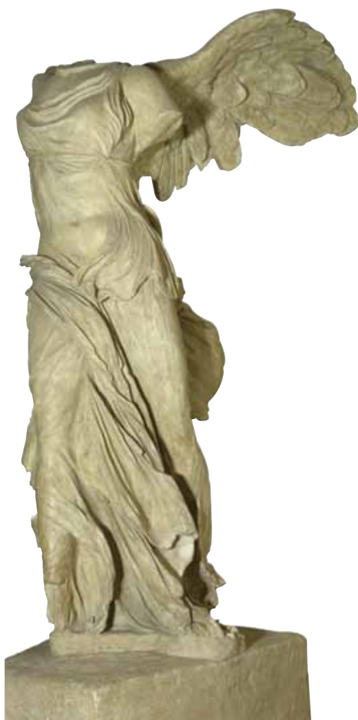
39. The marble statue of Nike of Samothrace housed at present in the Louvre Museum.

Therma derives its name from the hot sulphur springs of the area that have been known for their healing effects since Byzantine times. The entire area is a riot of greenery with plane and chestnut trees, wild strawberry trees ( arbutus unedo ), and myrtles (especially in the valley of the Fonias River, where you can find many "vathres"). Small boats that run excursion trips to the S coast of Samothrace start from the island's only anchorage, Kamariotissa. Distance from Chora: 12 km NE.