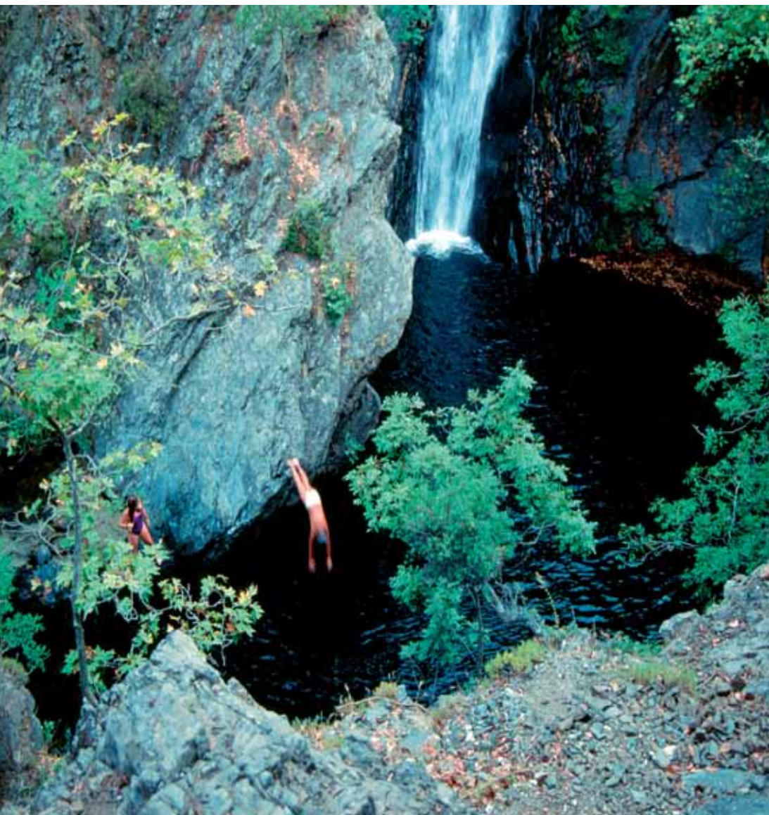
41. Vathra (natural pool) at Mount Saos, Samothrace Island.