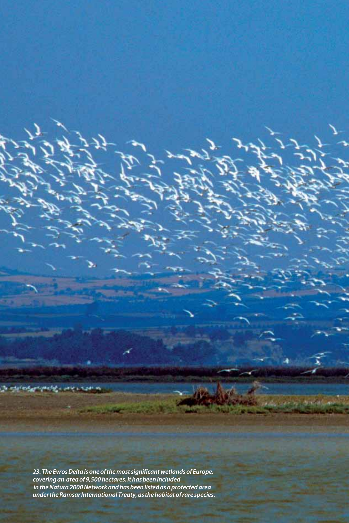
23. The Evros Delta is one of the most significant wetlands of Europe, covering an area of 9,500 hectares. It has been included in the Natura 2000 Network and has been listed as a protected area under the Ramsar International Treaty, as the habitat of rare species.